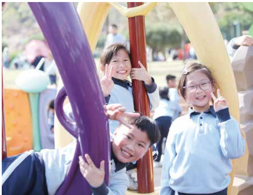
❖ 本校致力培養學生正向價值素養