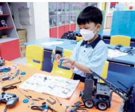
❖ 學習操作VEX IQ機械人