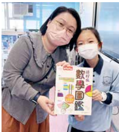
❖ 「ABC好學生獎勵計劃」 培養學生良好素養