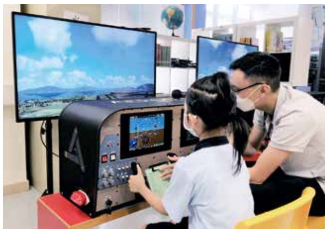
❖ STEAM 飛行探索活動