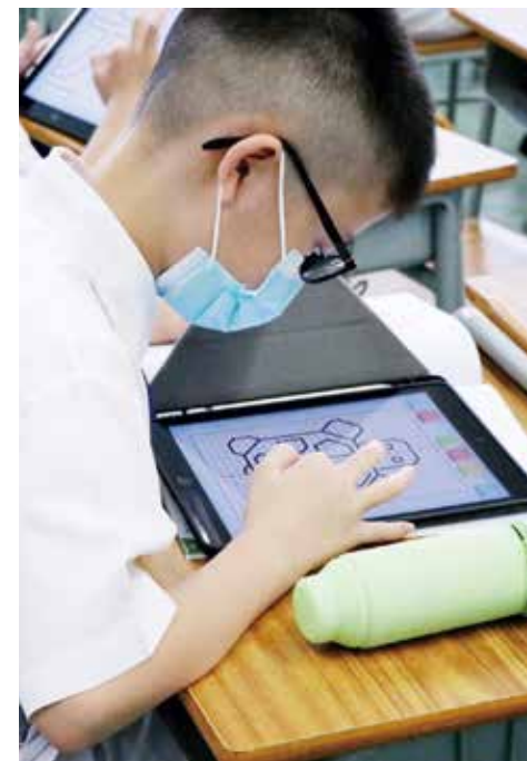
◆利用iPad探索對稱的世界

為了讓學生正面成長，本校推行「讓我閃耀計劃」，學生在活動中得到不同的學習經歷，例如領袖訓練、境外學習、才能訓練等，結合社區的不同資源和機構，讓學生在體驗中成長。另外，學校根據每位學生的特質、個性和不同方面的表現及才能，成立了「資優人才庫」，讓學生能按自己的步伐在不同的領域發展。