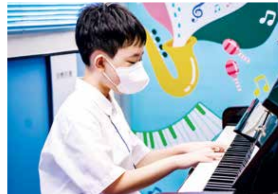
❖ 學業及課外活動均衡發展

We pledge to carry out the principle of "Serving the Community in the Spirit of Benevolence". We aim to provide quality holistic education to our students, and hope that our students have a balanced development in the domains of ethics, intellect, physique, social skills and aesthetics.